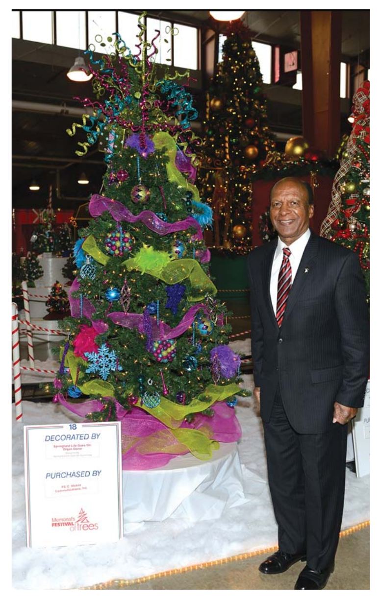
FESTIVAL OF TREES – Secretary of State Jesse White with the holiday tree decorated by the Springfield Life Goes On Committee for Springfield's Memorial Medical Center's Festival of Trees. More than 30,000 people attend the weeklong event each year. The committee's tree was purchased by PEC Mobile Communications Inc.