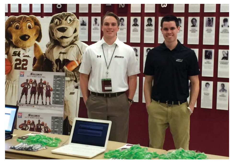
Southern Illinois University-Carbondale students and Saluki Athletics interns assist at the Donate Life women's basketball game at the arena in Carbondale on Friday, Feb. 19, to register organ /tissue donors.