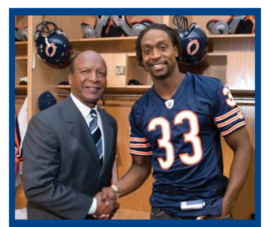
Secretary of State Jesse White and Chicago Bears cornerback Charles Tillman following shooting of the new donor commercial in the Bears' locker room at Soldier Field.

Seven children under age 1 are waiting for transplants in Illinois. Six wait for a liver, one waits for a heart.