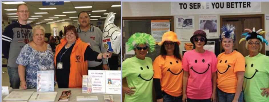
ABOVE LEFT: The Lombard Driver Services facility staff promotes Customer Service Week with a donor table and balloons. ABOVE RIGHT: The Benton Driver Services facility staff "clown around" during Customer Service Week in October.